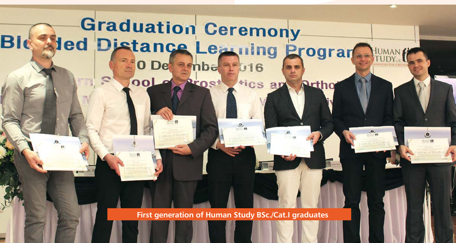
First generation of Human Study BSc./Cat.I graduates

Use the opportunity to meet peers from all corners of the world and exchange experiences.